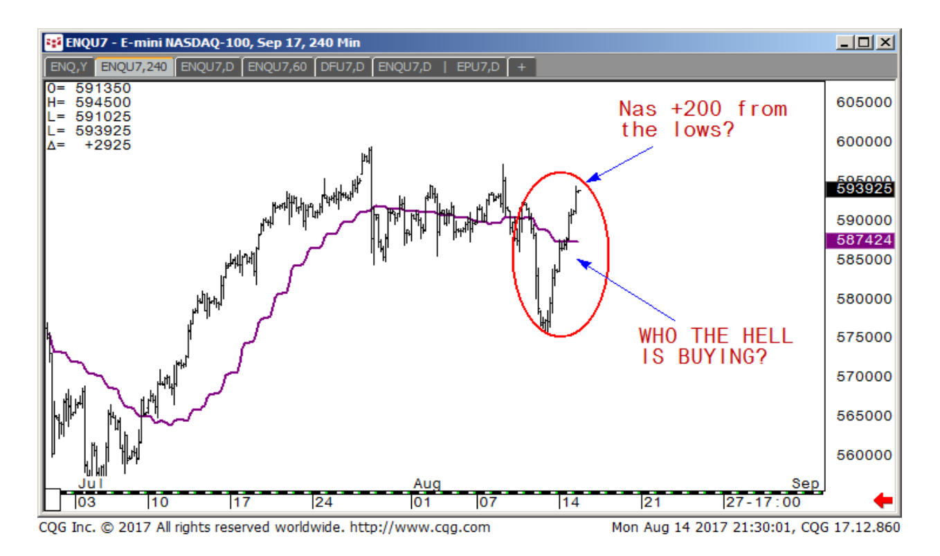
As you can see it rallied nearly 200 points from its lows on Friday!

The SEP SP500 Future held the Vwap and 38.2% Fib which both converged around the 2435 area. We feel that the range is now defined somewhat between 2435 and 2475 for now, with extensions coming only after either of those levels are breeched: