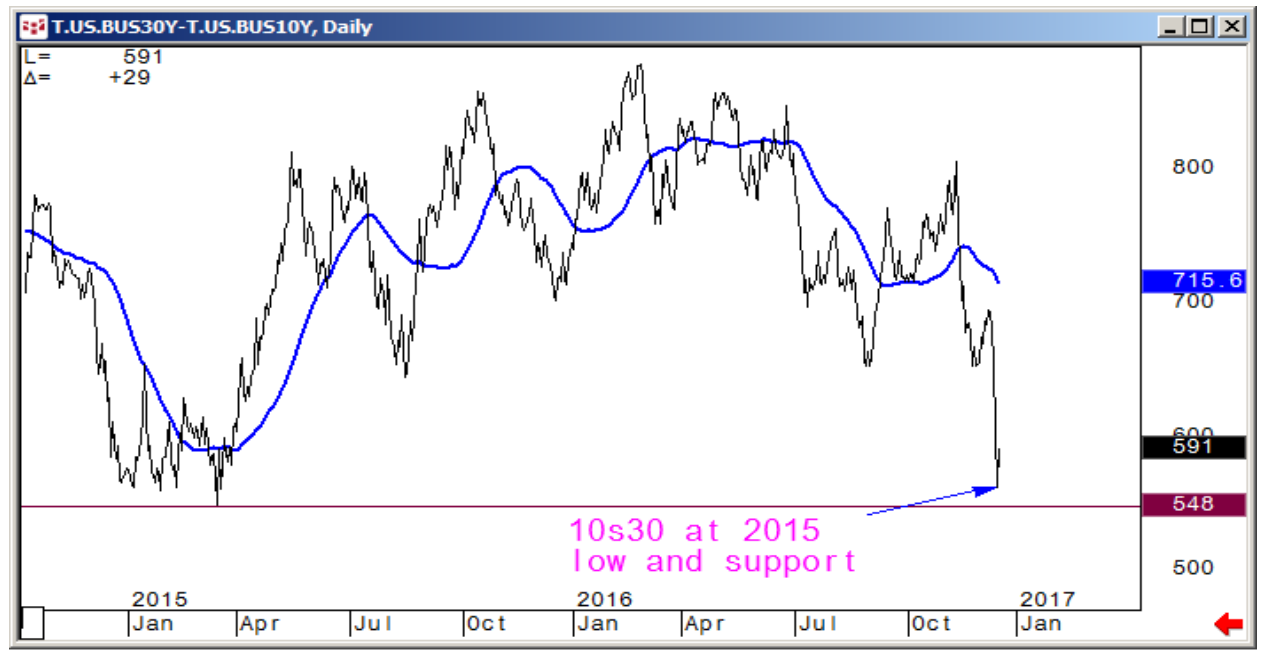
CQG Inc. © 2016 All rights reserved worldwide. http://www.cqg.com

The 10s30 US Treasury curve has flattened even more so since the election and is now right at March 2015 lows: